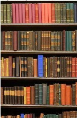
90 th percentile