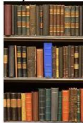
50 th percentile